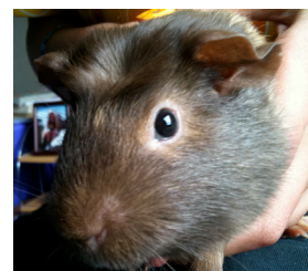
Come show off your new 'do.